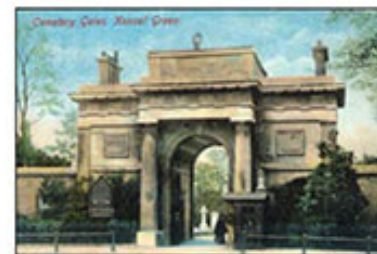
The Main Gate c.1905

Blondin monument Centre Avenue, south side