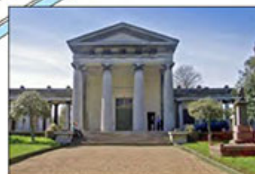
The Anglican Chapel

Ladbroke Grove Station (Hammersmith & City Line) (1.3 km / 0.8 miles) ↓