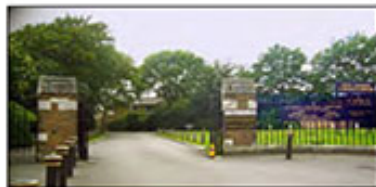
TOP OR WEST GATE (vehicle entrance)

Paths of Glory, The Friends of Kensal Green Cemetery, 1997